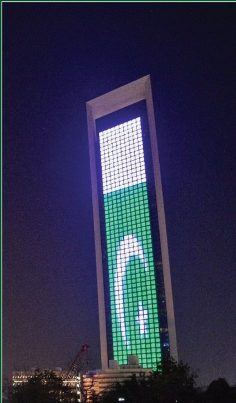
PAKISTAN'S NATIONAL FLAG DISPLAYED ON THE ADNOC BUILDING IN ABU DHABI

On Pakistan Day 2026, Pakistan's national flag illuminated the iconic Burj Khalifa at 7:20 PM, while the ADNOC Headquarters lit up in green and white to celebrate the National Day of the Islamic Republic of Pakistan. The beautiful tribute added pride and joy to the celebrations of this special occasion.