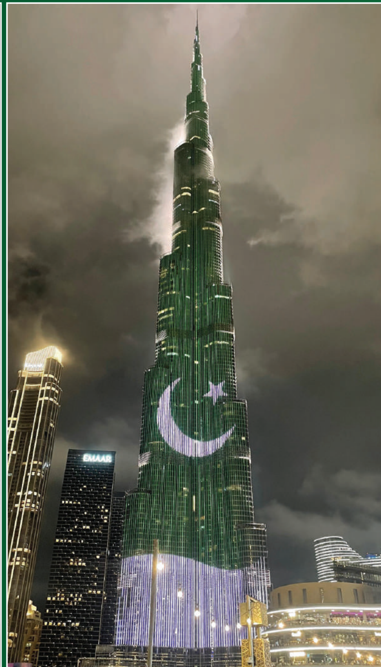
PAKISTAN'S FLAG DISPLAYED ON BURJ KHALIFA ON THE EVE OF 23RD MARCH